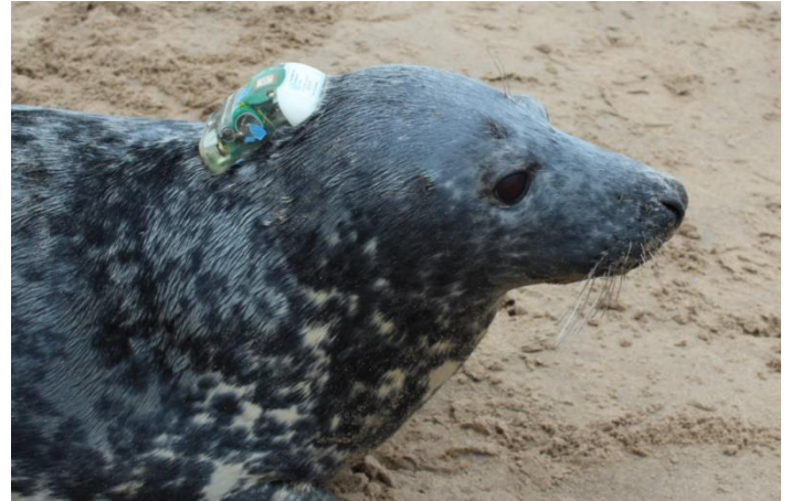
A grey seal wearing a GPS tracking tag.

Who? An experienced team from the Sea Mammal Research Unit at the University of St Andrews, who have caught and tagged over 1,000 seals, will carry out the work.